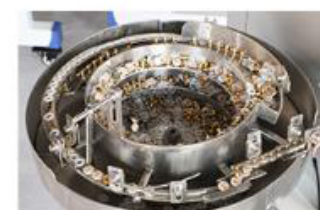
Automatic gasket filling(Option)