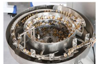
Automatic gasket filling(Option)