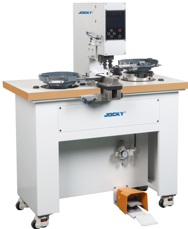
Table top type