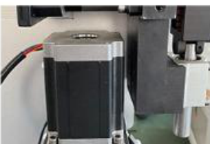
Stepper motor driven swing arm