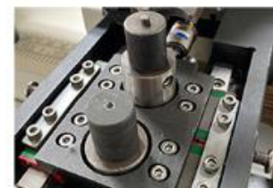
Punching and attaching consistently