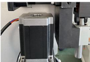
Stepper motor driven swing arm