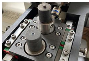
Punching and attaching consistently