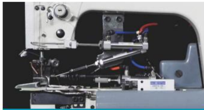
反包拉筒 reverse fold