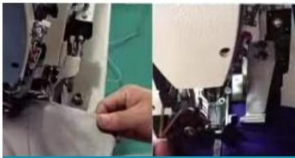
正包拉筒 Front fold