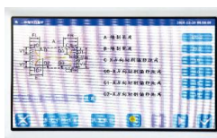
One key drawing function