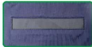
防晒服 SUN-PROOF CLOTHING