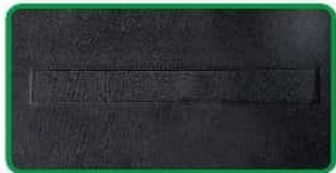
双面弹 DOUBLE-SIDED STRETCH FABRI