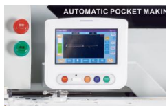
Intelligent operation system