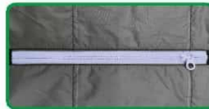
棉衣 COTTON-PADDED JACKET