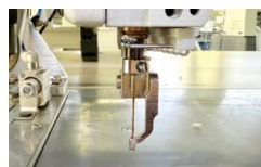
Middle pressure foot