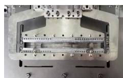
Separated inside and outside press frame