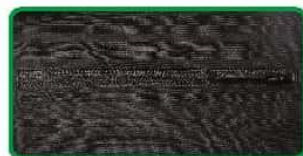
四面弹 FOUR-WAY STRETCH PANTS