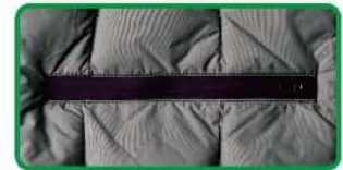
羽绒 DOWN FEATHER