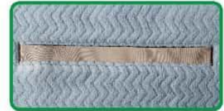
摇粒绒 POLAR FLEECE