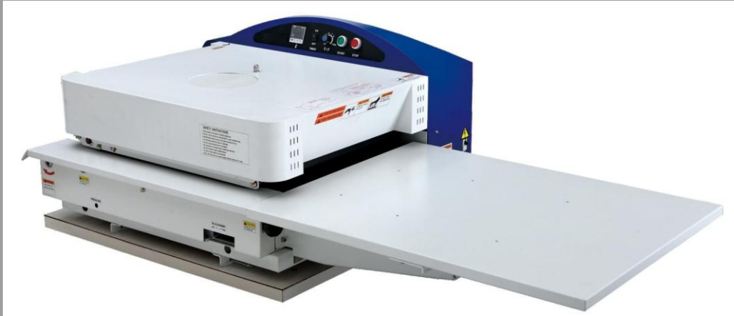
JK-450MS, Fusing width 450mm