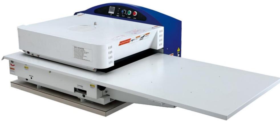
JK-450MS, Fusing width 450mm